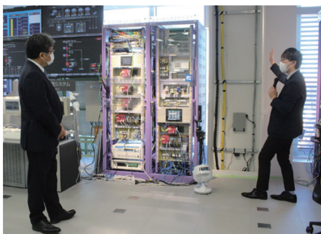
Minister HAGIUDA (Left) had a briefing on the simulated plant.

In December 2021, Mr. HAGIUDA, the minister of Economy, Trade and Industry, visited the exercise facility of ICSCoE in Akihabara. This facility installs simulated plants equipped with nearly actual machines to learn cybersecurity measures for control systems.