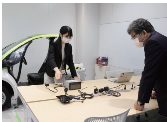
Minister HAGIUDA received the explanation on in-vehicle control systems.

Minister HAGIUDA enthusiastically questioned risks and security measures, the training contents of the Human Resource Development Program promoted by the ICSCoE, and security personnel and its community. Eventually, we could have a lively exchange of views with Minister HAGIUDA.