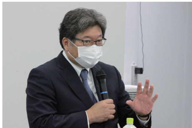
Minister HAGIUDA exchanged his views on the foresight of cybersecurity measures.

Minister HAGIUDA described, “the ICSCoE is an extremely crucial institution, concentrating the world-level human resources, techniques, and know-how, and a core hub responsible for developing top human resources, who will lead the whole industry.” Furthermore, he demonstrated the further significance of this center.