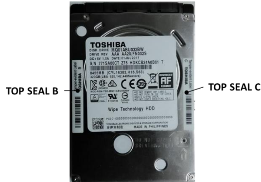
OVERVIEW OF TOP COVER

The operator is required to inspect the CM periodically for one or more of the following tamper evidence. If the operator discovers tamper evidence, the CM should be removed.