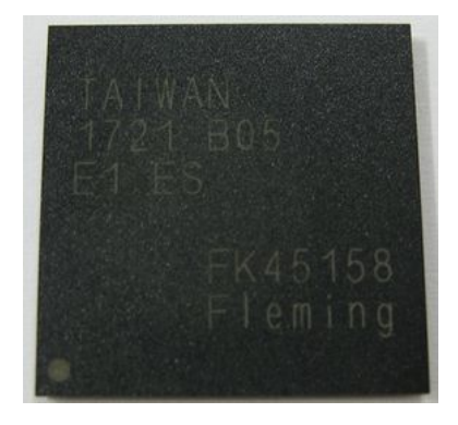
Figure 1 Appearance of the Canon MFP Security Chip