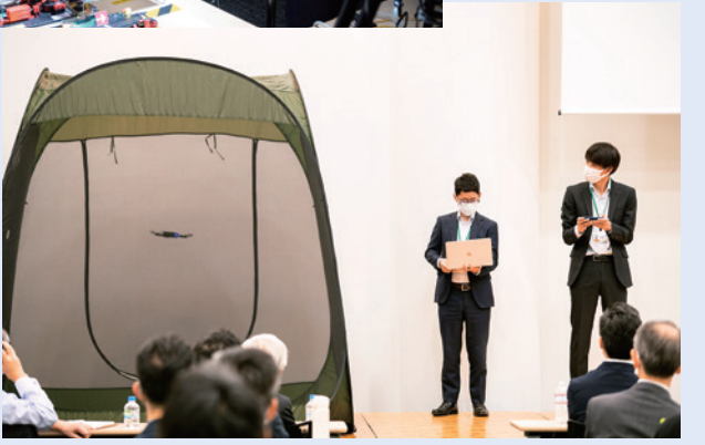
Demonstrated the mock attacks by flying a drone in a tent