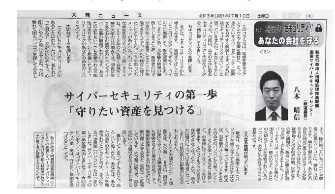
Appeared in the newsletter published by the Osaka Chamber of Commerce and Industry, "Daisho News" (July 10, 2021 issue)

With the aim of "raising the SMEs' security awareness level from zero to 0.1" in mind, the team interviewed the Chambers of Commerce and Industry in Osaka, Sapporo, and Nagoya, where the number of SMEs is high, to learn the actual circumstances of security measures taken by SMEs in each area. The team took the issues faced by the companies, the readers of the CCI newsletters, into account and published two easy-to-understand articles on security. We expect that these activities will contribute to improving security awareness among SMEs.