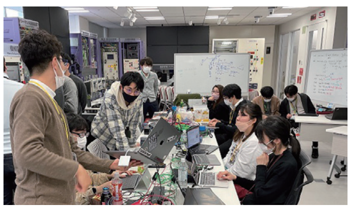
The participants implemented the verification of various security vulnerabilities against video control devices and network equipment, including video distribution/ emerging technologies in the broadcasting field. (Participation: 5 days from Feb. 5 to 10 (40 hours per person))

From my point of view, the trainees of the sixth cohort participated in the penetration testing after fumblingly studying how to conduct the Testing beforehand. Their proactive attitudes were fantastic.