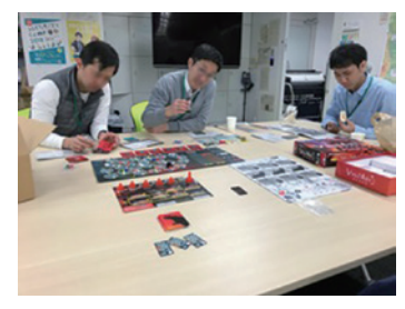
The outcomes produced from the final project.

awareness if we conducted a tabletop exercise utilizing these cards for factory security. However, I could not find off-the-shelf exercise satisfying our needs, so I made the card game for my company. It led to the efforts within the enterprise.