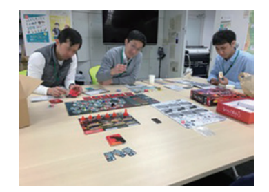
The outcomes produced from the final project

awareness if we conducted a tabletop exercise utilizing these cards for factory security. However, I could not find off-the-shelf exercise satisfying our needs, so I made the card game for my company. It led to the efforts within the enterprise.