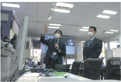
Minister NISHIMURA had a briefing on the simulated plants.

In February 2023, Minister of Economy, Trade and Industry NISHIMURA visited our ICSCoE exercise facility in Akihabara. During this visit, our instructor utilized our plant, which simulates control systems for critical infrastructures, to demonstrate potential cyber attacks and explain the possible consequences and damages caused by these attacks.