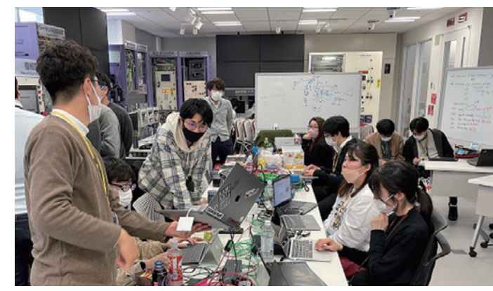
and network equipment, including video distribution/ emerging technologies in the broadcasting field. (Participation: 5 days from Feb. 5 to 10 (40 hours per person))

In February 2023, the National Institute of Information and Communications Technology (NICT) held a "Demonstration Experiment of Wide-Area Video Distribution Using Ultrahigh- Definition Video" realized by bringing technologies, human resources, and equipment of approximately 70 organizations from industrial, governmental, and academic fields. The graduates and trainees of the Core Human Resource Development Program (ICSCoE) formed a penetration testing (hereinafter called "Testing") team and participated in this experiment. We interviewed the team leader and members about the demonstration experiment this year, which we have attended for five consecutive years.