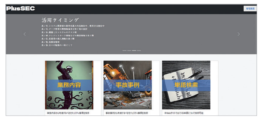
The screen images of tool

This tool enables users to search items through 3 approaches: business contents, incident cases, and word retrieval, and the team shapes it to access necessary information efficiently. Moreover, the purpose of this tool is that users can understand each item and recognize the importance of constructing and operating secure systems.