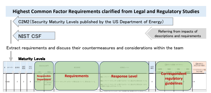
Development process of Maturity Model and summary of the model

The team established the maturity model - which enterprises can compass how overseas sites handle - and provide benchmarks. When creating this model, the members read up on the representative international regulations and guidelines and extracted 75 requirements emphasizing during the actual operations. In this model, the team set required countermeasures and the results by examining international standards and documents as evaluation axes. Moreover, they list the criticality and coverage of each item for users to comprehend more smoothly.