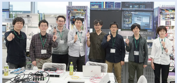
The project members

After completing the one-year program, I got a response that I had made it this far in becoming a cybersecurity expert. Now, the learning experience at the ICSCoE became a turning point in my career. I will diligently attend to my duties with the idea of making a new start as an individual engaging in security after returning to my company.