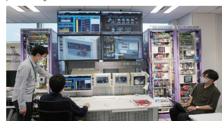
The simulated plant used for Testing

As the team learned basic knowledge to prepare Testing plans and reports, they utilized the ICSCoE's simulated plant (for electricity systems) in Akihabara to recognize difficulties in Testing and gain practical insights.