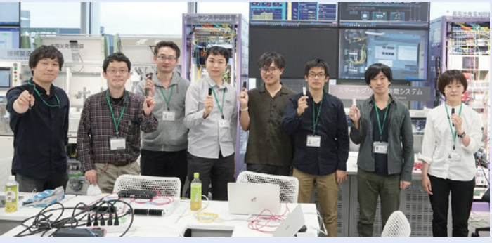
The project members

After completing the one-year program, I got a response that I had made it this far in becoming a cybersecurity expert. Now, the learning experience at the ICSCoE became a turning point in my career. I will diligently attend to my duties with the idea of making a new start as an individual engaging in security after returning to my company.