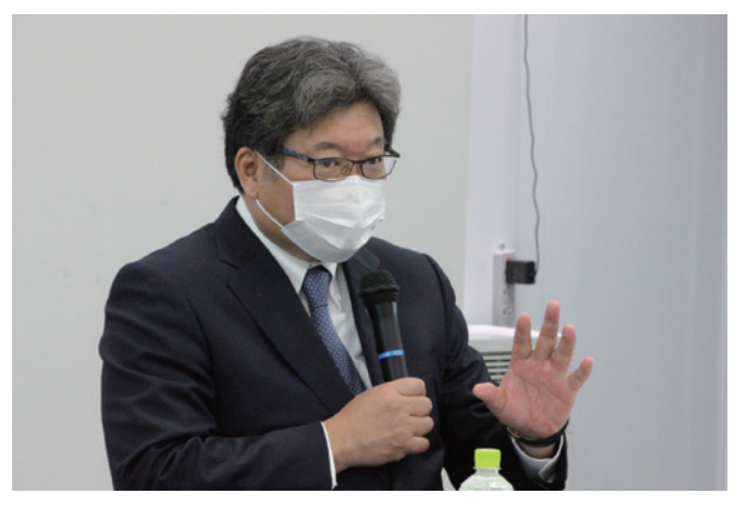
Minister HAGIUDA exchanged his views on the foresight of cybersecurity measures.

Minister HAGIUDA described, "the ICSCoE is an extremely crucial institution, concentrating the world-level human resources, techniques, and know-how, and a core hub responsible for developing top human resources, who will lead the whole industry." Furthermore, he demonstrated the further significance of this center.