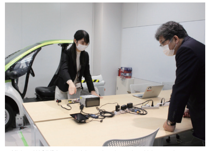
Minister HAGIUDA received the explanation on in-vehicle control systems.

Minister HAGIUDA enthusiastically questioned risks and security measures, the training contents of the Human Resource Development Program promoted by the ICSCoE, and security personnel and its community. Eventually, we could have a lively exchange of views with Minister HAGIUDA.