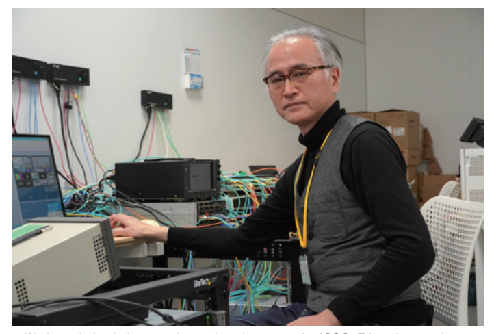
We brought back the experimental equipment to the ICSCoE locations and performed experiments.

We expect to apply the technological outcomes of cybersecurity and IP remote production gained through this demonstration experiment Ikegami Tsushinki performed in its fourth year to the future coverage and sports relay