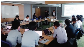
Introduced the Japanese initiatives and exchanged opinions with the French experts

From September 23 through 24, 2019, the Core Human Resource Development Program held a two-day deployment exercise visiting France, and 20 trainees participated in it. The French governmental agencies and industrial security experts