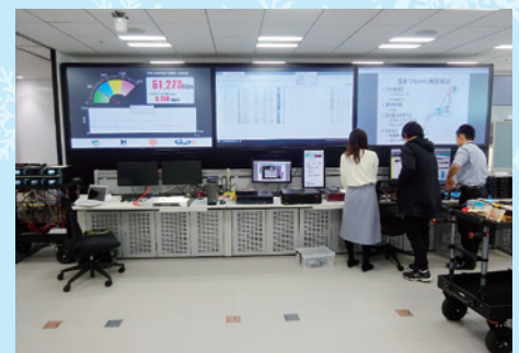
The demonstration experiment targets are the video transmission devices on the actual operation sites or for the next generations.