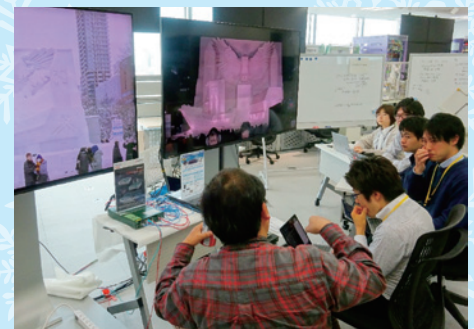
ICSCoE team assesses the risks replacing arbitrary images.