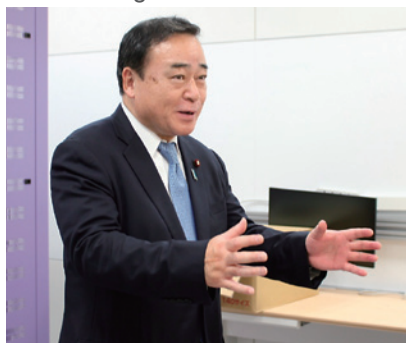
Minister Kajiyama indicated the importance of this project.