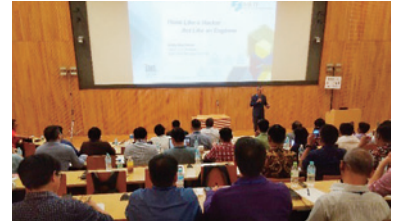
The lecture given by the US expert