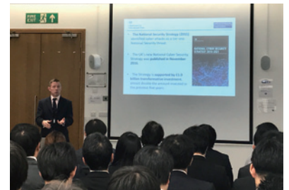
The lecture on the cybersecurity strategies by the UK government

From December 2 through 3, 2019, the Core Human Resource Development Program held a two-day deployment exercise visiting the UK, and 37 trainees participated in it. The trainees took the lectures on the cybersecurity efforts given by the representatives from the UK government, automotive industry, start-up companies, and participated in the lively question and answer sessions with these representatives.