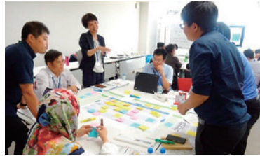
The scene of the group work beyond boundaries

In this exercise, 69 trainees from the Core Human Resource Development Program participated, and we invited 35 trainees from the Indo-Pacific region. We held the lecture given by the US experts and a workshop where sharing the issues and measures regarding the security of control systems for each country and region among the participants, and we actively exchanged the information beyond boundaries.