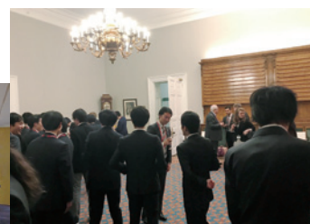
▲ Networking event with security-related officials (UK)