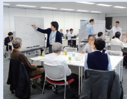
Scene of group work by participants