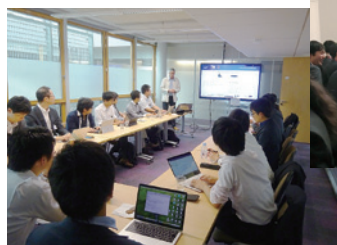
▼ Exchange of opinions with researchers at IRT SystemX (France)*