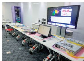
Next-generation video transmission equipment etc. used in the demonstration test

Trainees participated in a demonstration experiment (with approximately 200 people from 51 organizations) to distribute high-resolution live videos of the Sapporo Snow Festival to Tokyo and Osaka in real time. Penetration tests were conducted on video transmission devices that are currently used in television