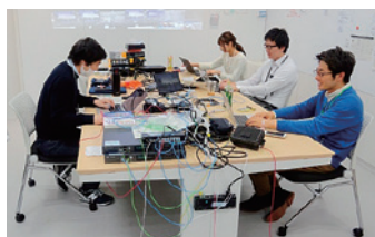
Trainees working on demonstration experiments