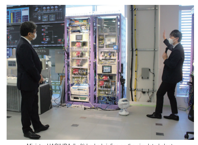
Minister HAGIUDA (Left) had a briefing on the simulated plant.

In December 2021, Mr. HAGIUDA, the minister of Economy, Trade and Industry, visited the exercise facility of ICSCoE in Akihabara. This facility installs simulated plants equipped with nearly actual machines to learn cybersecurity measures for control systems.