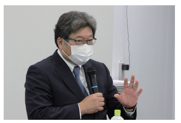
Minister HAGIUDA exchanged his views on the foresight of cybersecurity measures.

Minister HAGIUDA described, "the ICSCoE is an extremely crucial institution, concentrating the world-level human resources, techniques, and know-how, and a core hub responsible for developing top human resources, who will lead the whole industry." Furthermore, he demonstrated the further significance of this center.