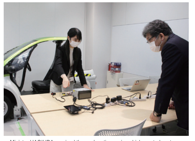
Minister HAGIUDA received the explanation on in-vehicle control systems.

Minister HAGIUDA enthusiastically questioned risks and security measures, the training contents of the Human Resource Development Program promoted by the ICSCoE, and security personnel and its community. Eventually, we could have a lively exchange of views with Minister HAGIUDA.