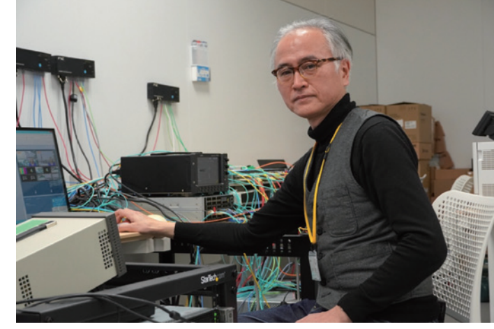
We brought back the experimental equipment to the ICSCoE locations and performed experiments.

We expect to apply the technological outcomes of cybersecurity and IP remote production gained through this demonstration experiment Ikegami Tsushinki performed in its fourth year to the future coverage and sports relay