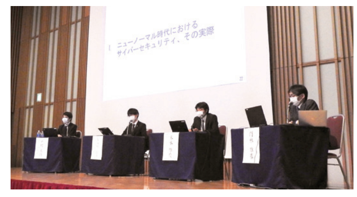
The conference was held at Keidanren Kaikan.

We will introduce the contents extracted from the discussion on "Maximizing the potential of the ICSCoE graduates" as follow.