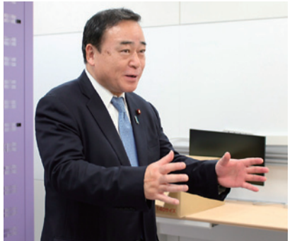
Minister Kajiyama indicated the importance of this project.

arising from leaks of sensitive information from the cyber attacks against critical infrastructures or power outage and facility shut-down from the attacks against control systems to support Japanese industries from policy aspects. Also, METI has been developing and publishing the cybersecurity guidelines (ex. Cyber/