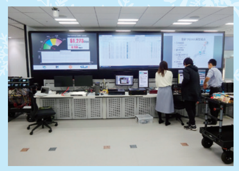
The demonstration experiment targets are the video transmission devices on the actual operation sites or for the next generations.