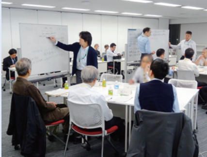
Scene of group work by participants