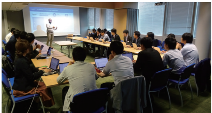
Trainees can understand the latest global trends from experience (France, 2019)

Japan and France have a commonality in their approaches where both nations have their own critical infrastructures in various areas including automotive and electric power. Although these two countries bear some resemblances, they can learn from each other because each country has fields tackling way ahead of the other. Another feature of our exercises is that trainees can witness the actual cybersecurity systems or system demonstrations at research institutions.