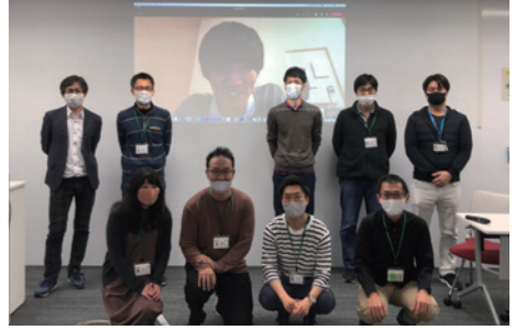
A send-off event was held for the exercise participants

Each year, we have sent the trainees to the United States for the DHS exercise; the fourth cohort, however, will participate remotely in the exercise this year. We will nominate suitable trainees to participate in this exercise as representatives of ICSCoE based solely on proficiency in English. I was involved in this candidate nomination and am sure they will proactively participate in this exercise.