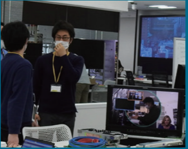
The participants performing the remote production experiments