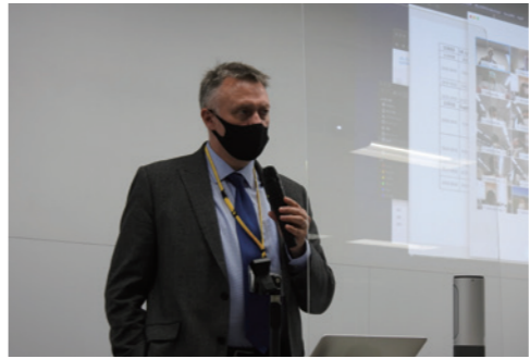
The Overseas Deployment Exercise for the 4th cohort was held with the cooperation of the British embassy

The experts remotely lectured the trainees from the UK and France, and they asked and answered questions by the audio and chat tools. We also invited the experts from the Israeli Embassy to explain their latest efforts in cybersecurity.