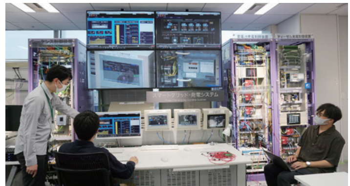
The simulated plant used for Testing

As the team learned basic knowledge to prepare Testing plans and reports, they utilized the ICSCoE’s simulated plant (for electricity systems) in Akihabara to recognize difficulties in Testing and gain practical insights.